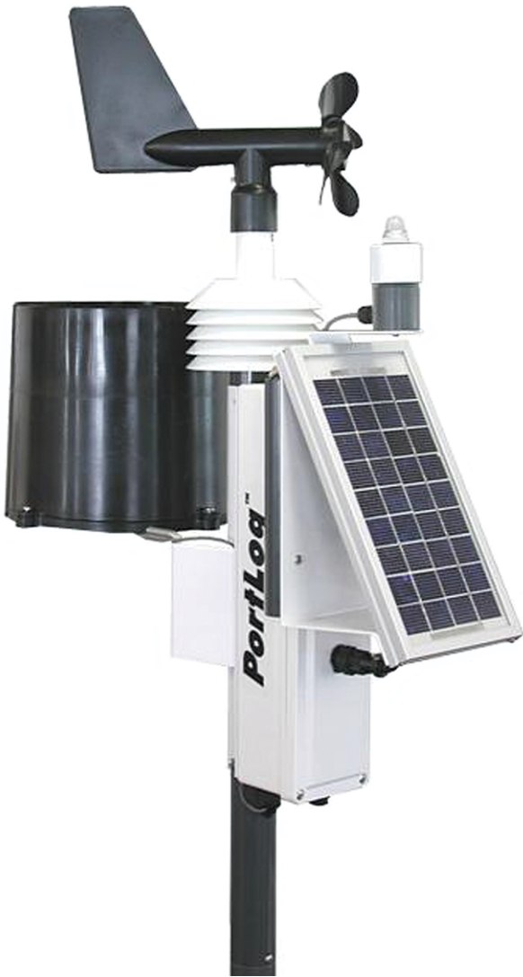
Model : PORTLOG